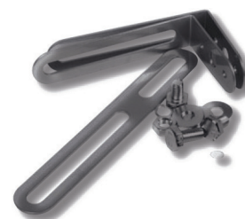
Above: included mounting hardware

Wide frequency response and high sensitivity makes it suitable for speech and background music reproduction in large areas. Typical application areas of COM loudspeakers are railway stations, subways, churches, factory buildings, warehouses and outdoor parking lots. Mainly designed for outdoor areas.